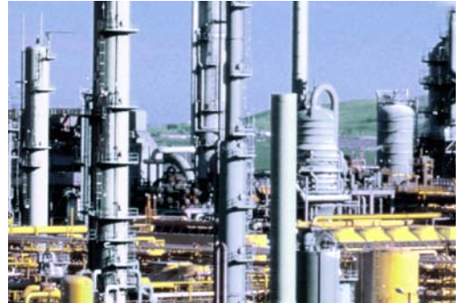
Intrinsically safe infrared sensors for temperature measurement and monitoring in hazardous areas.