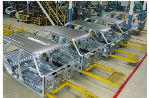
From paint curing to thermoforming, noncontact temperature measurement provides consistent product quality in the automotive industry.